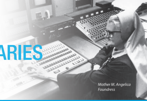
Mother M. Angelica Foundress

The Newsletter for EWTN Media Missionaries Fall Issue 2023 Volume XXVIII No.15